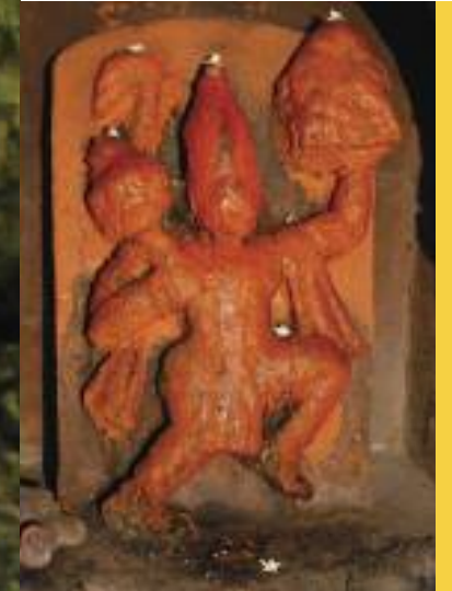
The god Hanuman in the Pola temple