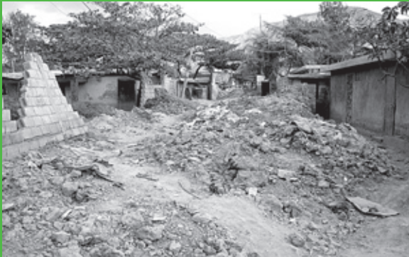
Gonaives at the present time, following hurricane devastation