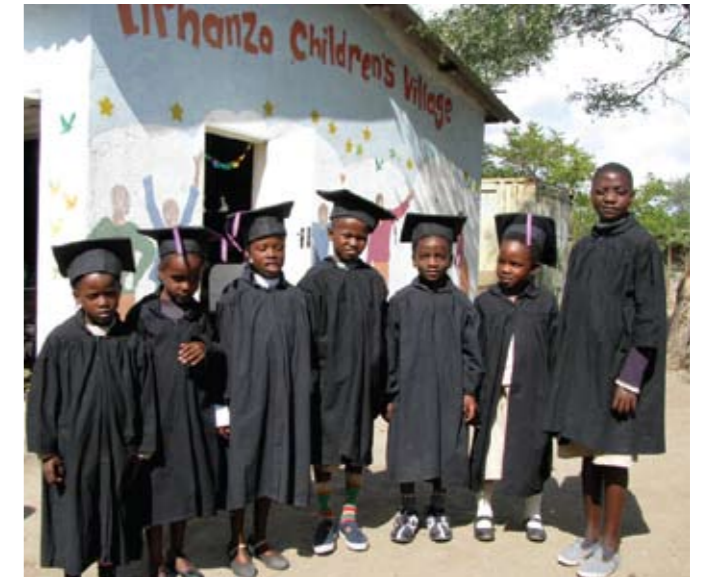
The photographs show children attending the temporary school at the Village and primary school dressed in graduation gear manufactured by the sewing group.

Sponsorship of Lirhanzo Village children provides not only food and shelter to the children of the Village but also assists in the children's education. The Village has now established a primary school in a building on the Village site and educates children from the surrounding community on a fee paying basis or goods and labour in kind from the community. The school is now providing early education for 120 children. LCV provides and trains four teachers to the school and the Zimbabwe Department of Education another four. The Community Education Fund also provides opportunities for the older students not attending school, teachers, community members wanting to be teachers and Village carers and workers to take on further studies eg teacher training, sewing, woodwork, business management, through the Zimbabwean colleges.