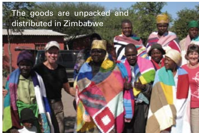
The goods are unpacked and distributed in Zimbabwe

Container number 12 has just been loaded and is ready for transportation to Zimbabwe. A series of emails from Mike gives a wonderful summary of what is done by volunteers, the sort of goods packed and how much work goes in to the whole process of collection, packing and transport. It also shows the process is a lot of fun for those involved!