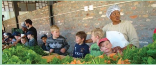
Kids from Grade 2 of Western Province Prep School