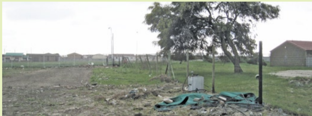
Asande Food Garden

Co-ordinating Office Physical Address: c/o The Business Place Philippi, 7 Cwango Crescent (Cnr New Eisleben Rd and Lansdowne Rd, behind Shoprite Centre) Philippi, 7785, Cape Town tel: 021 371 1653 • fax: 086 6131178 Postal Address: PO Box 44, Observatory, 7935 Khayelitsha Garden Centre tel/fax: 021 361 3497 Nyanga Garden Centre tel/fax: 021 386 3777 email: info@abalimi.org.za • web: www.abalimi.org.za