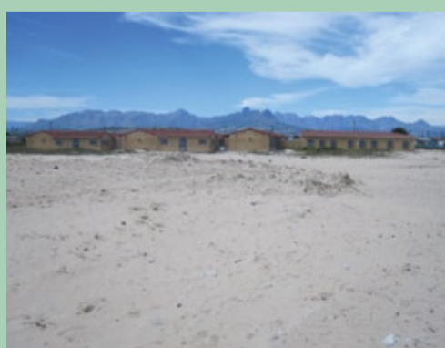
Cwayita land at the beginning