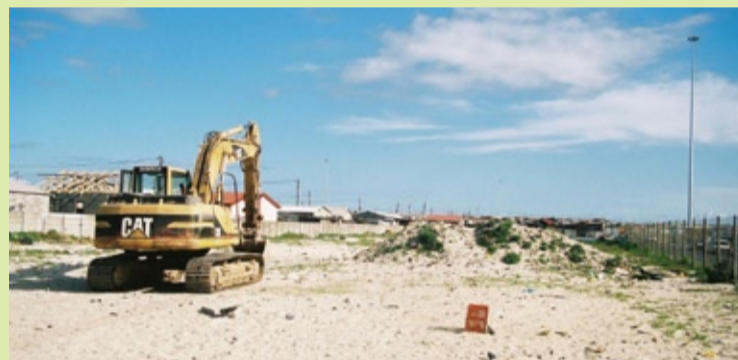
The land at the start

SCAGA I is based in Macassa, Khayelitsha and consists of 10 full time female members and 3 part time members originating mainly from the Eastern Cape. They also have a care taker who lives there. Before they started their community group, they suffered from hunger and unemployment. They chose to name their garden Siyazama which means "we are trying". And yes, they tried to change their lives and have now successfully achieved livelihood status. Thanks to an Abalimi gardening campaign in Macassa, Khayelitsha, the women were able to meet and form their group. They started off with basic training for backyard gardening and now they are planting and harvesting on a 5000 m 2 plot of land.