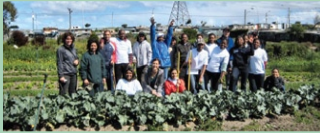
Do it Day Volunteers 2008