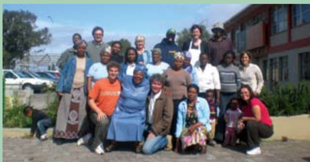
Abalimi has an excited, involved, moved, powerful, happy, caring, loving and authentic Team, and wants to present itself in a short way, so you get to know who is leading and working in Abalimi