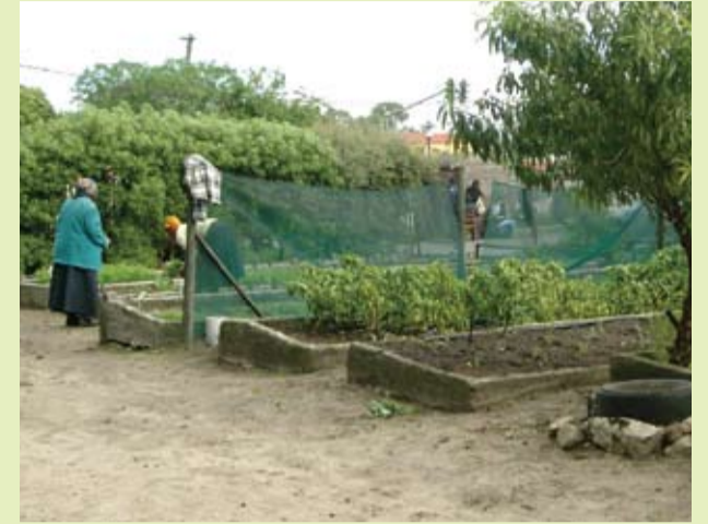
Preparing a seed sowing demonstration at Nyanga Garden Centre to show Home gardeners how to plant different seeds

the townships. They are closely linked to the Fieldworkers who look out for needs of the individuals, in terms of expanding their home plot or starting community plots, or how to improve the gardening in general.