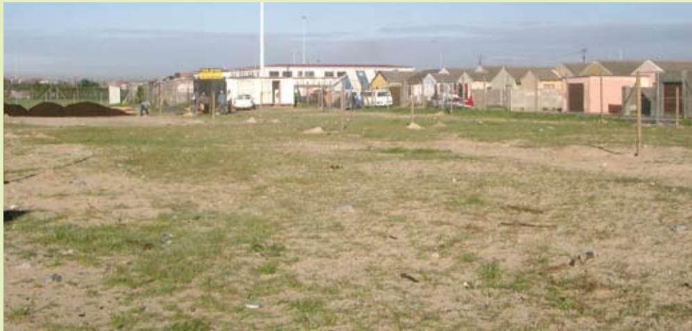
New Eden in Khayelitsha

Co-ordinating Office Physical Address: Cwango Crescent, (Cnr New Eisleben Rd and Lansdowne Rd, behind Shoprite Centre) Philippi, 7785 tel / fax: 021 371 1653 Postal Address: PO Box 44 Observatory, 7935 Khayelitsha Garden Centre tel / fax: 021 361 3497 Nyanga Garden Centre tel : 021 386 3777 Email: info@abalimi.org.za web: www.abalimi.org.za